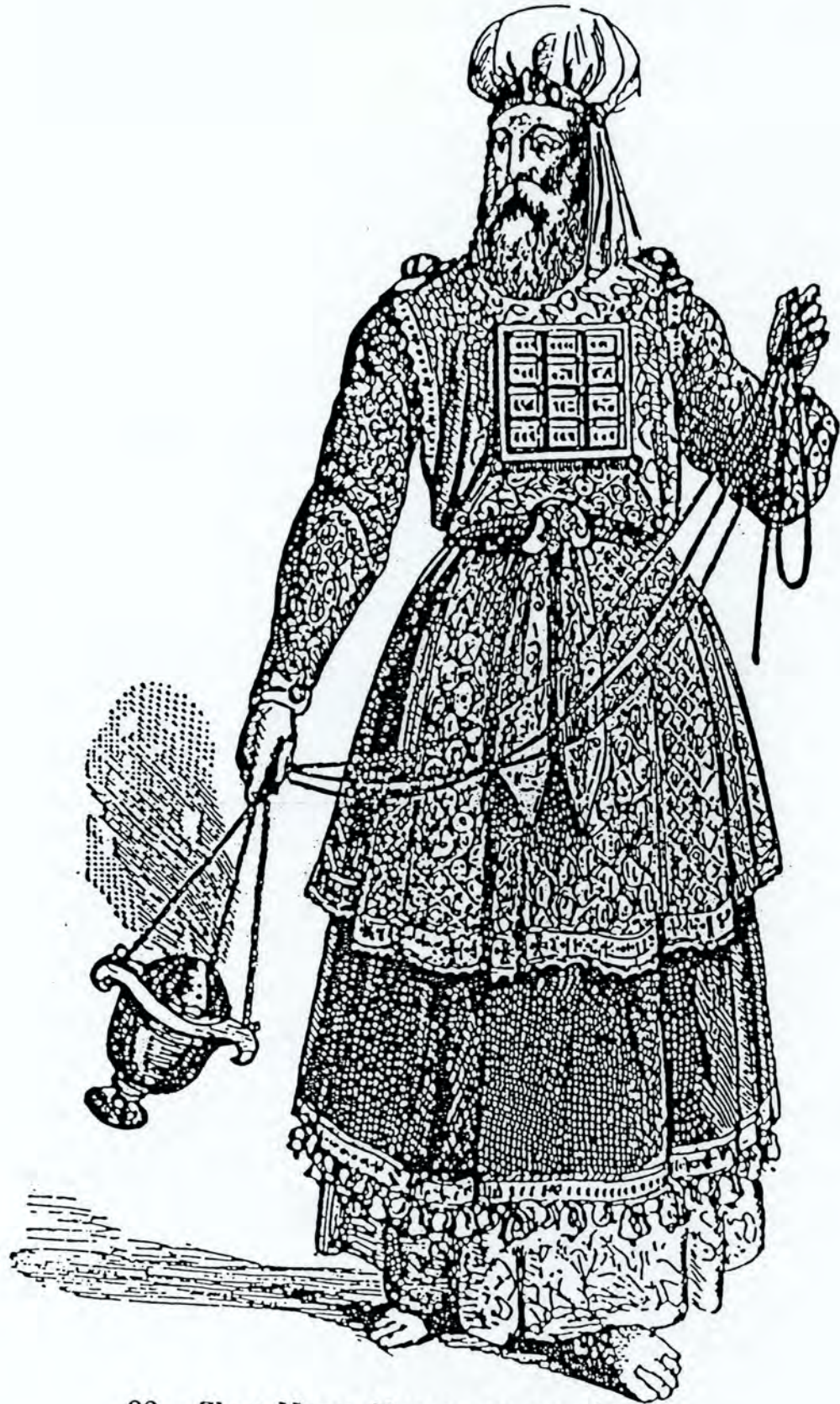
32.—THE HIGH-PRIEST IN HIS ROBES.