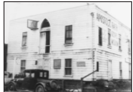
The building on Azusa Street where the Power fell in 1906.

There is a sweet spirit of unity among Pentecostal missions in Los Angeles and workers in suburban towns. Every Monday morning, the missionaries and workers from these different points meet together for prayer. All are in one accord.