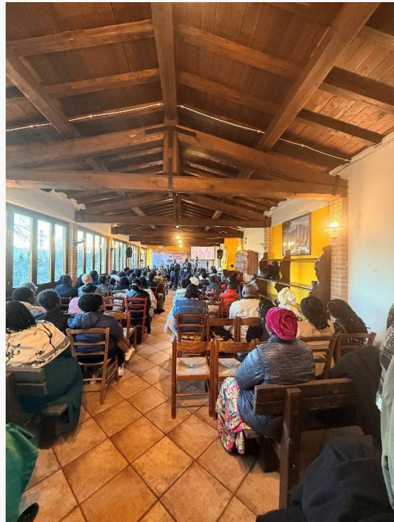
Evening service — congregation