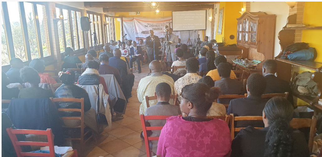
Congregation gathered for the Ordinance Services — Resurrection Sunday afternoon