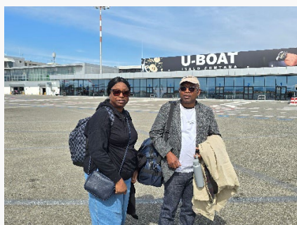
Brethren arriving at Airport