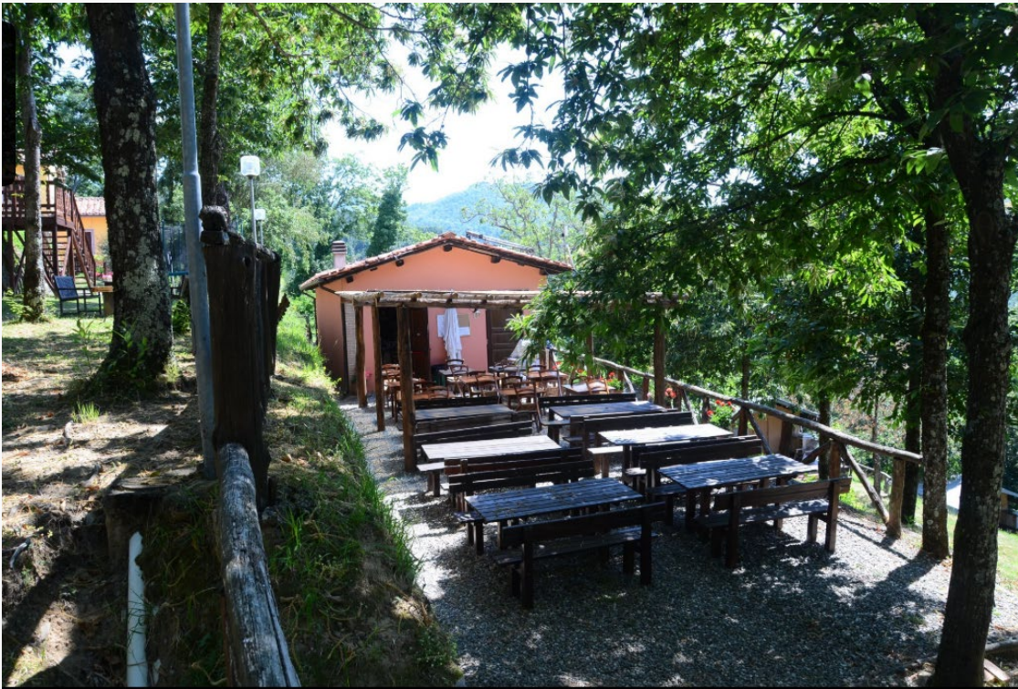
Venue — Camping Pian d'Amora, Coreglia Antelminelli, Lucca, Italy