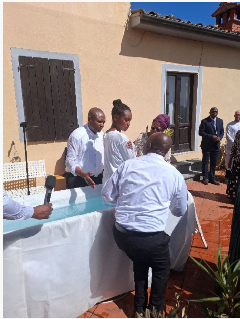
Water baptism — Sunday afternoon