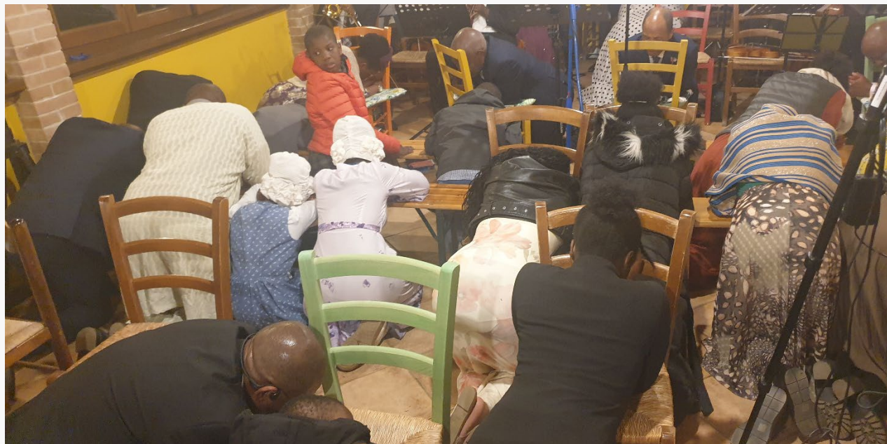
Altar time at the Farewell service