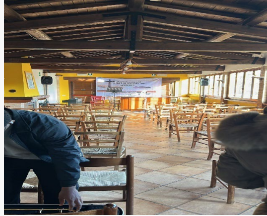
Meeting Hall — Camping Pian d'Amora