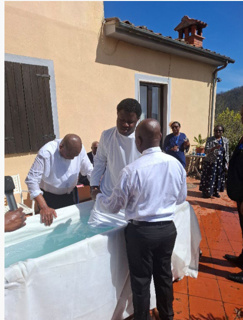
Candidates being baptised