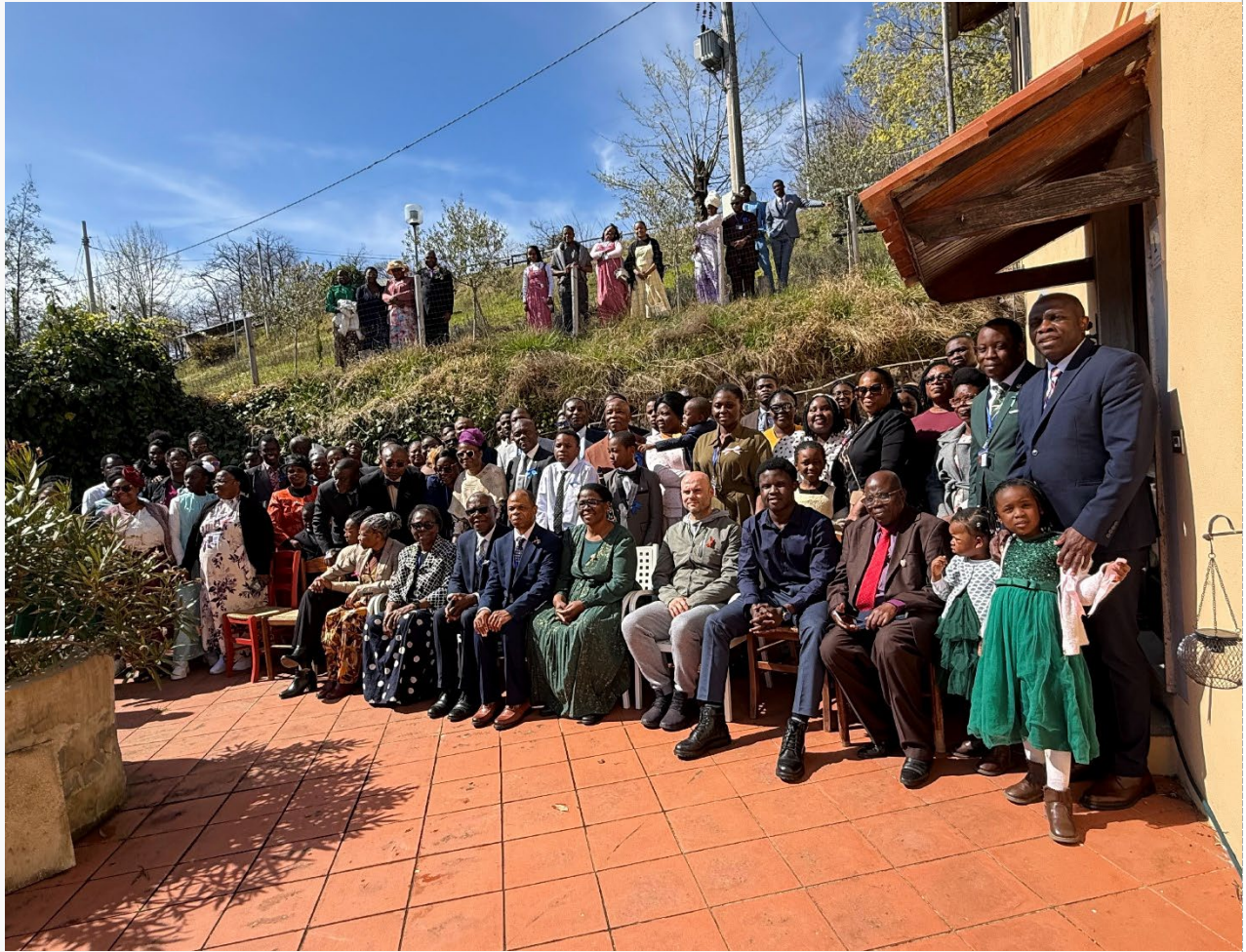
Water baptism — the full baptismal service at Camping Pian d'Amora