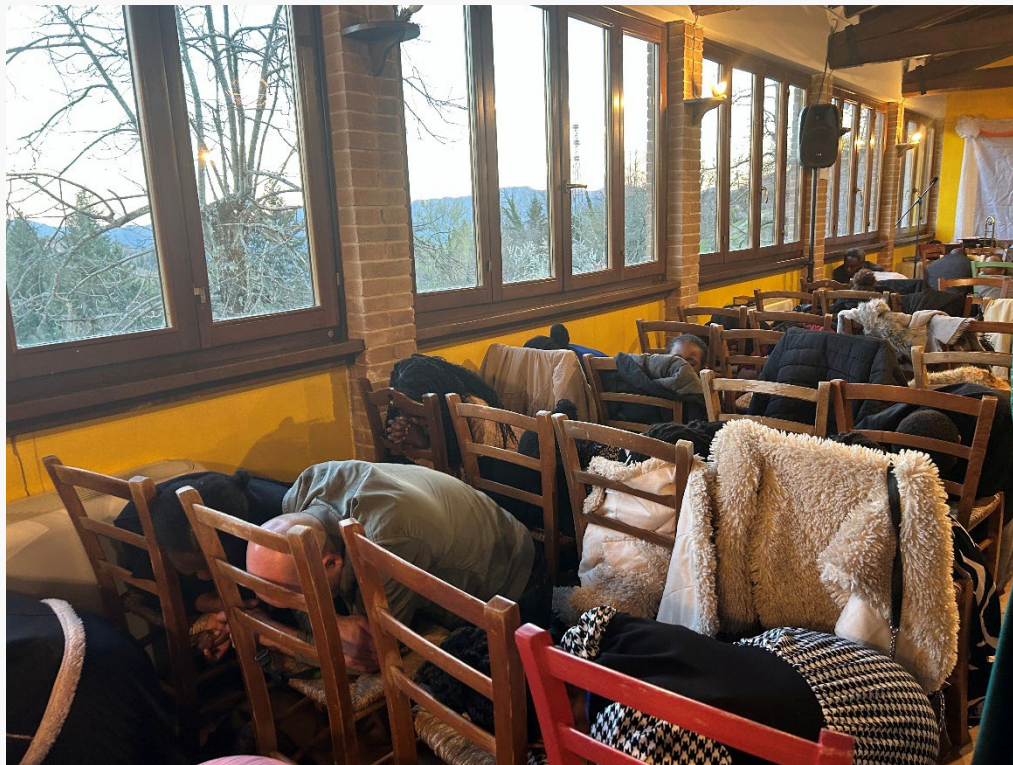
Prayer Room Session — Saturday morning