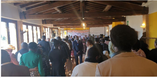
Congregation - Sunday morning