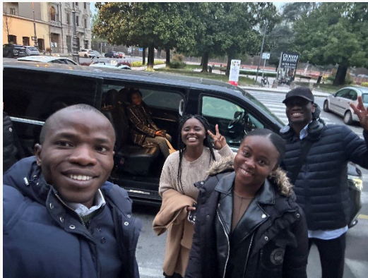
Brethren saying their farewells — Monday, 6th April