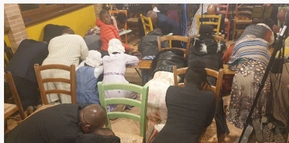
Congregation during the Revival and Farewell Service