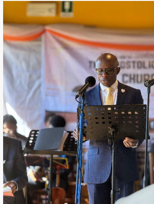
Prayers, Bible reading and solo rendition