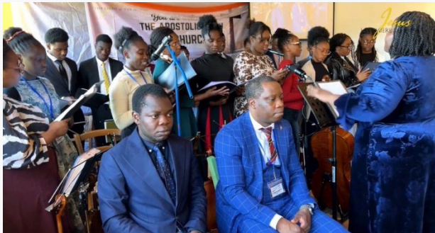
Youth Service — Saturday afternoon