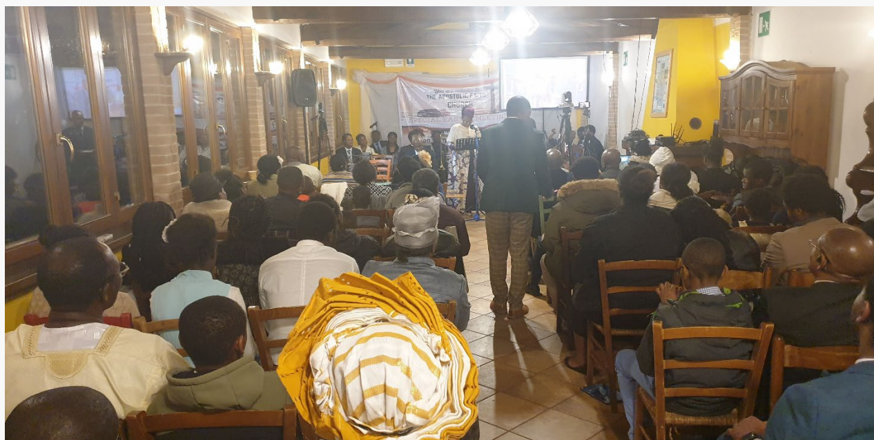
The full congregation gathered for the Farewell Service — Sunday, 5th April 2026