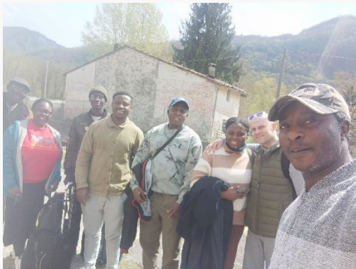
Brethren arriving at Ghivizzano-Coreglia Train Station

The spirit of anticipation that preceded the meeting was evident in the early arrivals. A small group of five brethren made their way to Coreglia Antelminelli ahead of the official programme, with arrivals recorded on the 31st of March and the 1st of April 2026. The majority of attendees arrived on Thursday, 2nd April, with additional brethren arriving on Friday, 3rd April as the programme was already under way. With Delegates from Ireland, Germany, France, Spain, Romania, the Netherlands, Malta, Austria, Italy, and the United Kingdom, the family of God converged on this quiet corner of Tuscany with hearts full of expectation.