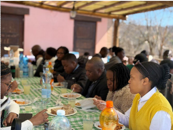
Dinner fellowship — Good Friday evening