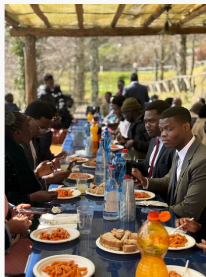
Lunch fellowship — brethren sharing a meal together, Friday afternoon