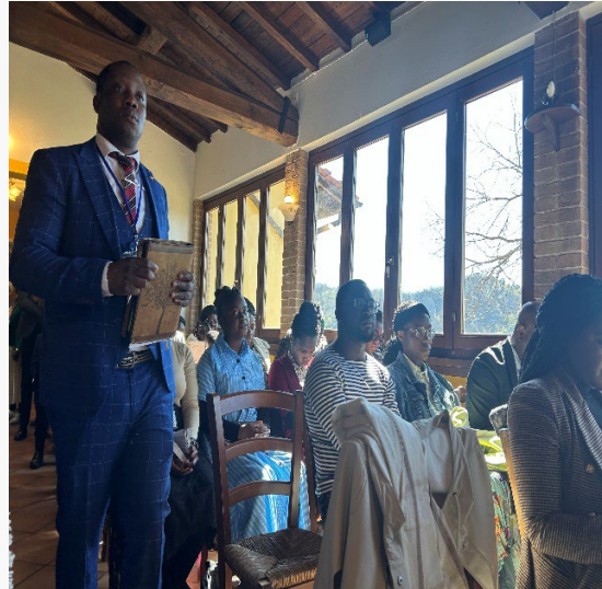
Congregation during the Bible Teaching session