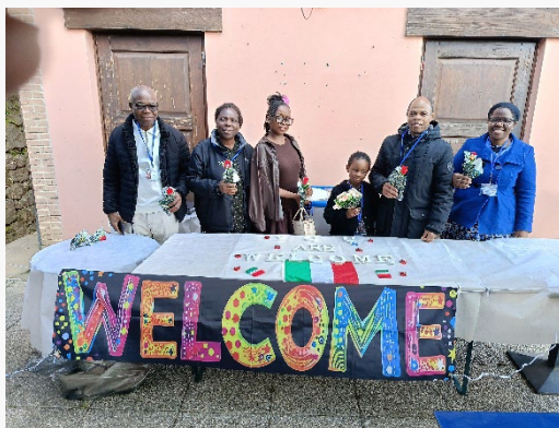
Welcome party at Camping Pian d'Amora