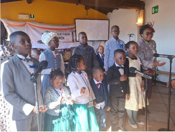
Sunday School children performing — Resurrection Sunday morning