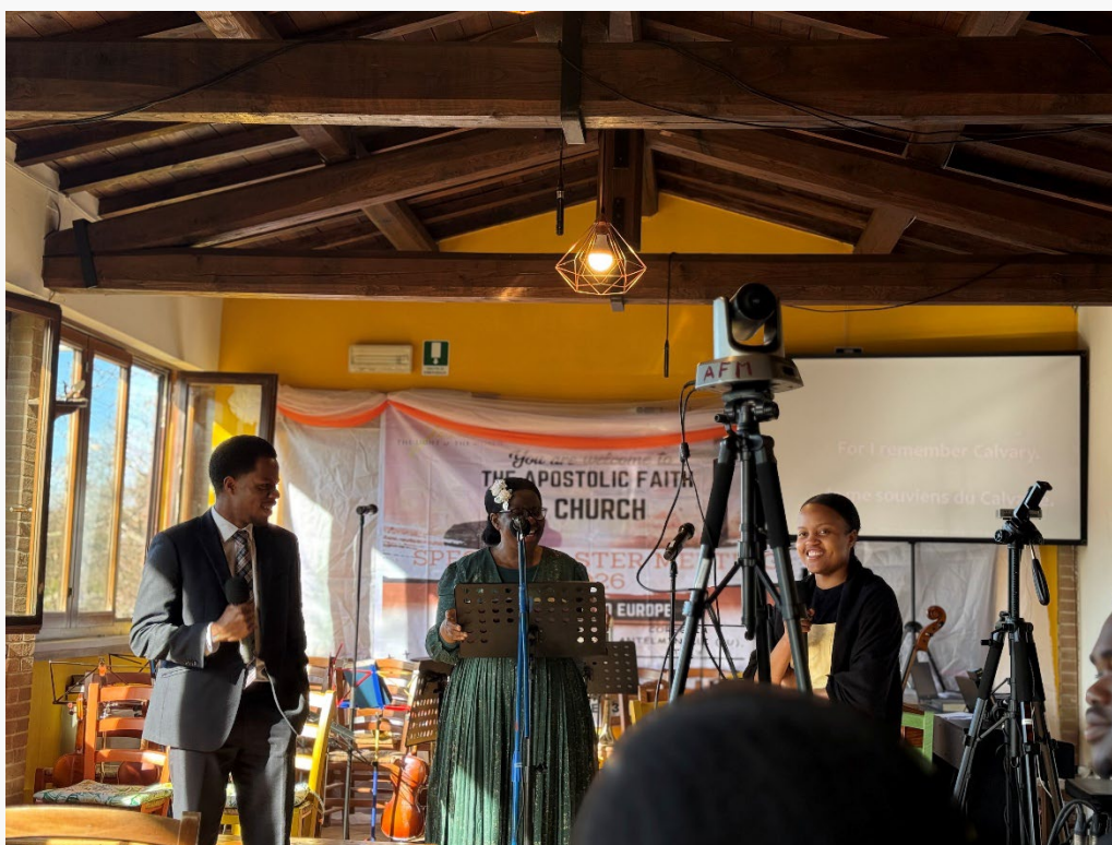
Sunday School in session — Resurrection Sunday morning