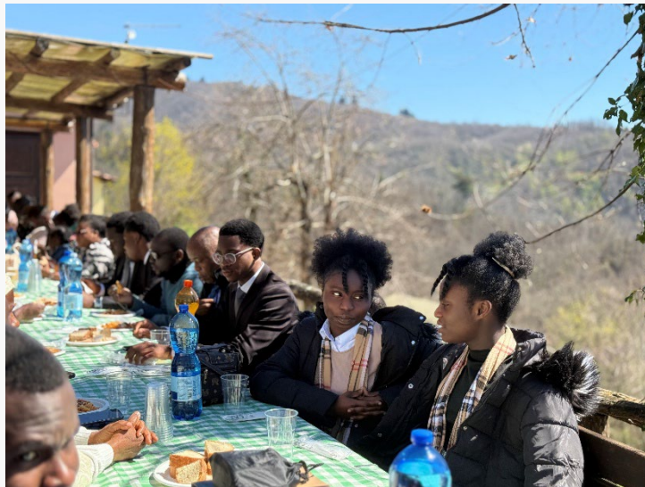
Lunch fellowship — Saturday afternoon