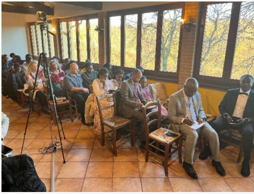
Concert Part I — Worship and Praise