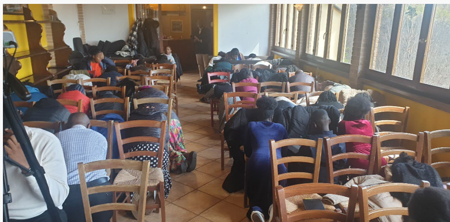
Prayer Room Session — Friday morning, Good Friday

cherished occasions of fellowship and community throughout the retreat. Following breakfast, the officiating workers assembled in the prayer room from 11:00 to 12:00 to prepare their hearts before God, ahead of the morning Easter Bible Study.