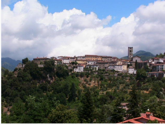
Panoramic view from the venue terrace

Coreglia Antelminelli is a municipality situated in the Province of Lucca, approximately 70 kilometres northwest of Florence and 25 kilometres north of Lucca. The venue, perched amid the beautiful Tuscan hills, offered a lovely terrace with panoramic views, providing a tranquil and inspiring setting for worship, fellowship, and the study of God’s Word over Easter days.