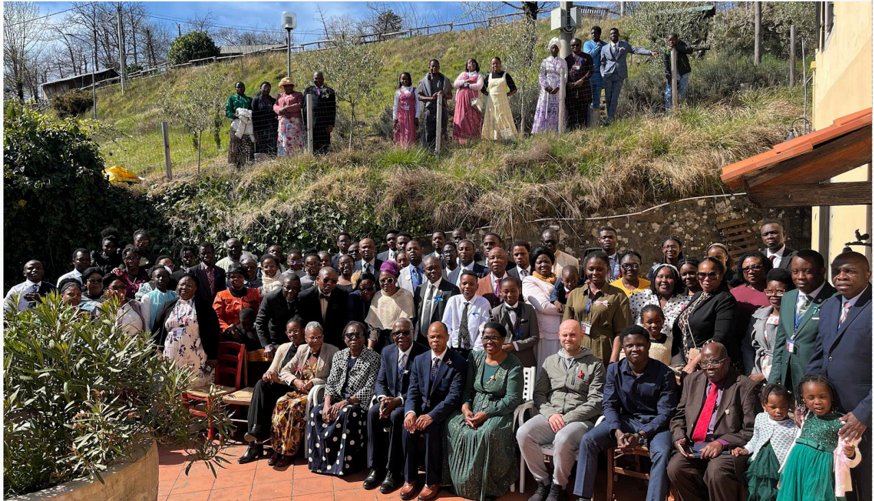
Group photograph — all attendees, Easter Special Meeting 2026, Coreglia Antelminelli