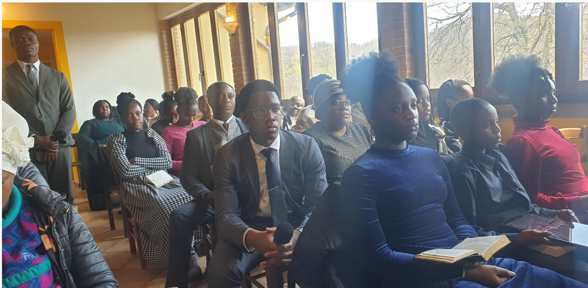
Congregation in the Meeting Hall during the Easter Bible Study