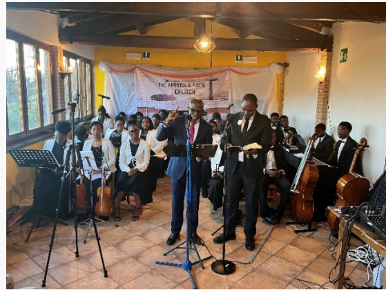
Concert Part II — Resurrection and Eternal Hope