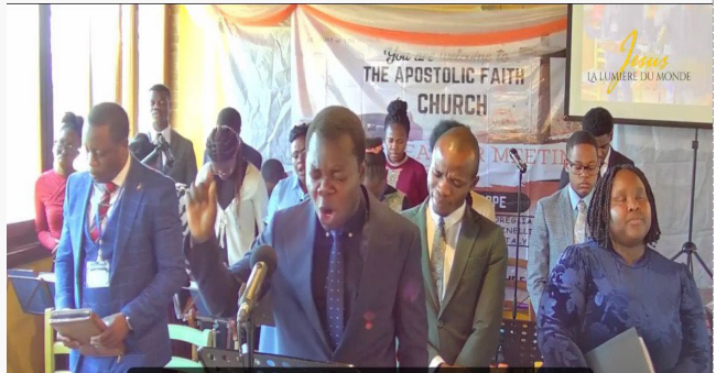
Young people in worship