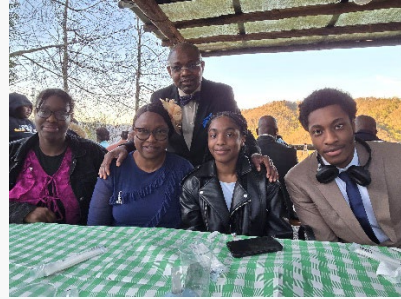
Last moments of fellowship before departure