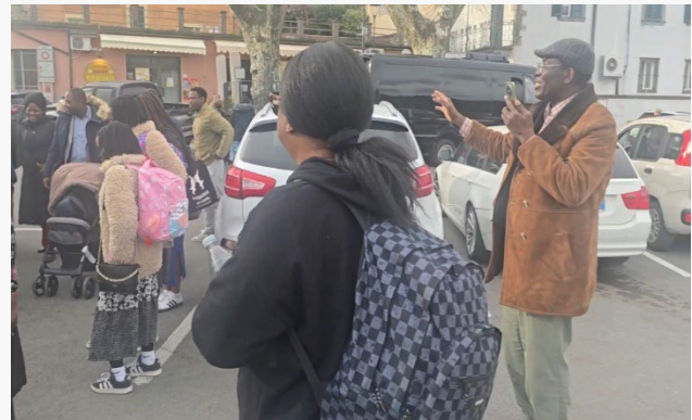
Welcome to Coreglia Antelminelli