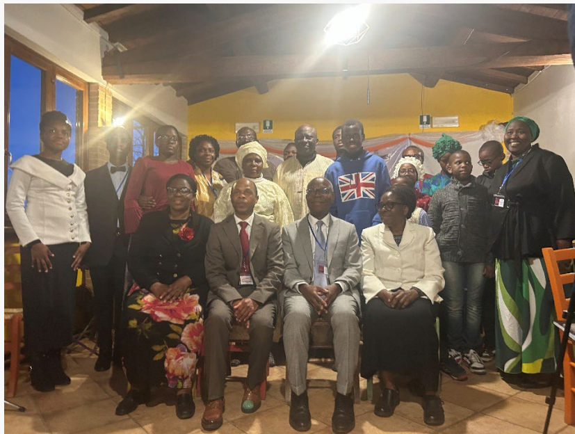
A photograph session with our Italian brethren — Saturday evening