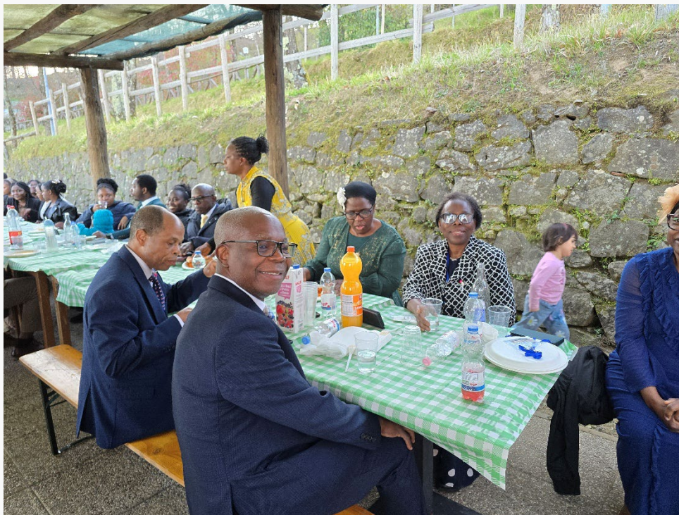
Lunch fellowship — Resurrection Sunday