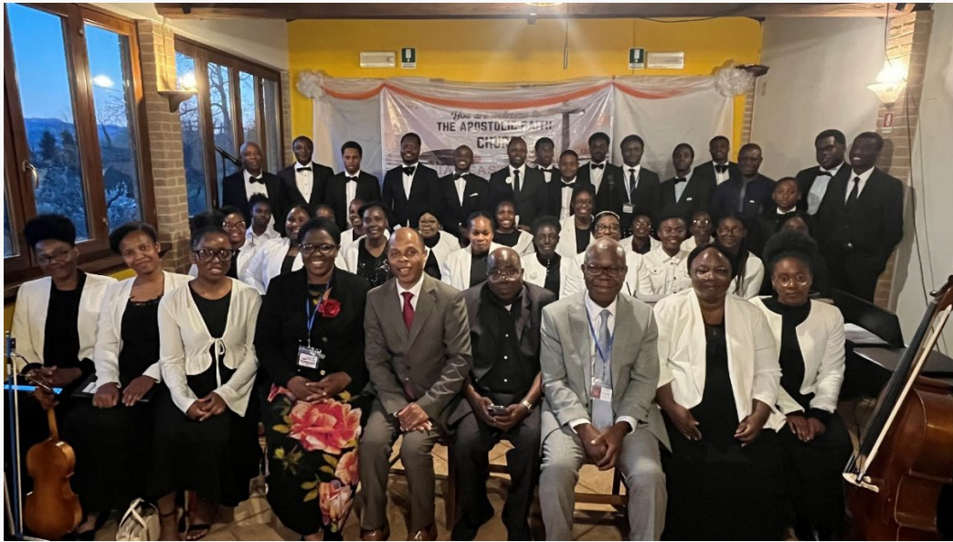
Full choir on stage during the Easter Music Concert — Saturday, 4th April 2026