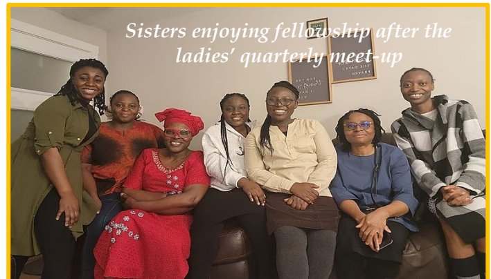
Sisters enjoying fellowship after the ladies’ quarterly meet-up

We always look forward to our special women’s events and this quarter was not an exception. We enjoyed a sweet fellowship at Motilola’s house with lots of inspiring games, discussions and prayer. Extending on this special activity was another unique personalized ‘shout-out’ activity that was focused on celebrating the women in Calgary church on the International Women’s Day (March 8th).