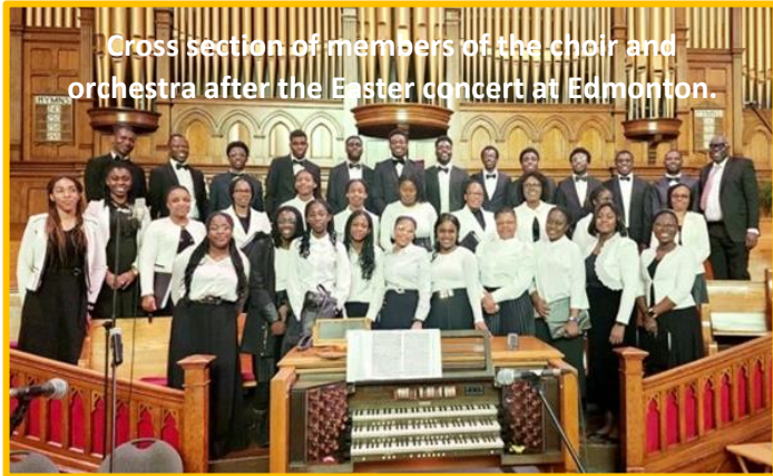
Cross section of members of the choir and orchestra after the Easter concert at Edmonton.

The concert featured the works of classic masters including Handel’s Messiah, “His Yoke is Easy,” and “Worthy is the Lamb.” The concert began with the orchestra playing, “Water