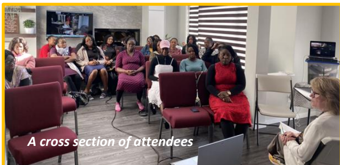
A cross section of attendees

Her discussion touched on the basic qualifications of a worker. You need to be saved, sanctified, and filled with the Holy Ghost. Your life must be aligned with all the truths of God's Word. Christ in the home, Christ in the church, Christ