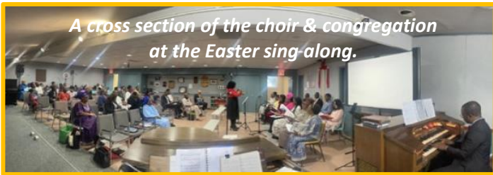
A cross section of the choir & congregation at the Easter sing-along.