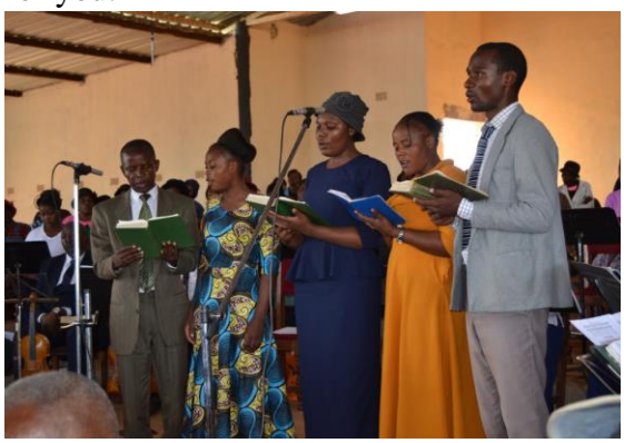
Quintet singing "Honey in the Rock"