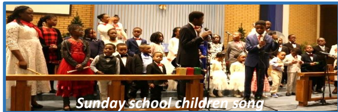
Sunday school children song

After the first half, members of the choir stepped out for a break while the children presented a short Christmas program which included a playlet about the Shepherd's