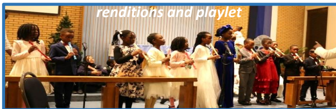
renditions and playlet