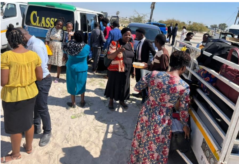
Time to say "Goodby"