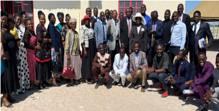
Group photograph of adult and children Campers