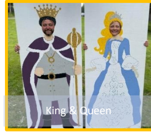
King & Queen