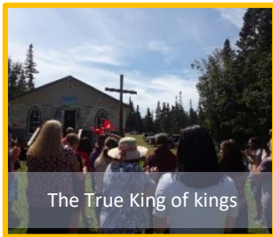
The True King of kings