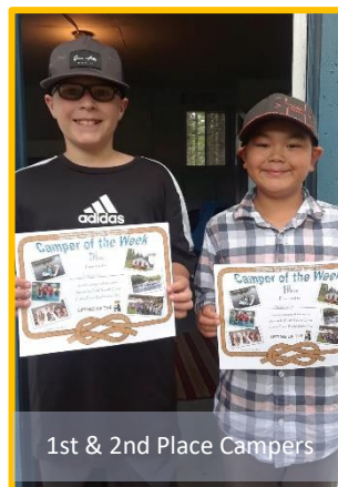
1st & 2nd Place Campers