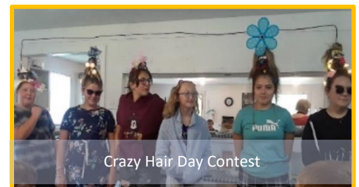
Crazy Hair Day Contest