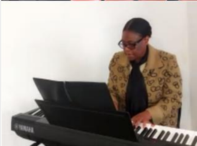
Pic: Music Director: Southern Africa