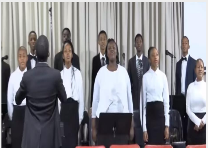
South Africa Choir

On the list was pieces such as “praise the lord oh Jerusalem” by the choir, orchestration playing “give the world a smile” , strings quartet playing Suit by J.P. Rameau from and the Lord is a man of war by G.F. Handel which was a male duet to mention a few.