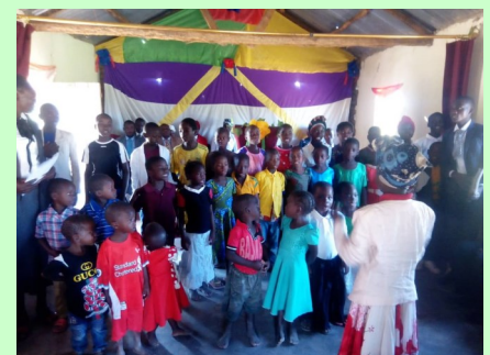
Elementary children in Ilambo

The dual then proceeded to Ilambo where they held a 3 days revival. Ilambo is one of the biggest branches in Tanzania. Lately, the Lord has been adding people to the church. The attendance on Sundays is usually over hundred people. The church they initially built can no longer accommodate them. Therefore, they bought a piece of land last year where they want to build a bigger church that can accommodate them.