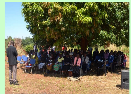
Brethren in Chinyunyu

Over 100 locals attended including the Senior headman. With over 50 of those from Lusaka, the total attendance recorded was 174 (84 women, 61 men and 29 children).