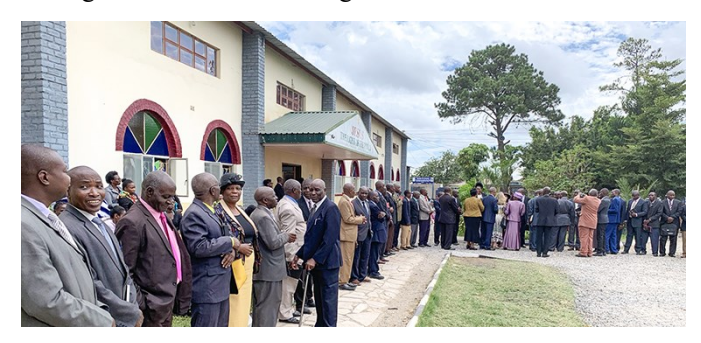
A group of workers during camp meeting

At the close of the 50 years, we have over 100 established churches across the country and there has been a rapid expansion of the work recently especially around Lusaka where a number of Bible study centres and groups have been opened. In its strides to disseminate the Gospel everywhere and faster, the church has acquired an Industrial Printing press that will enable the ministry to print thousands of literature to be distributed to all its branches in Zambia and the entire region of east Africa both for spiritual growth and soul winning.