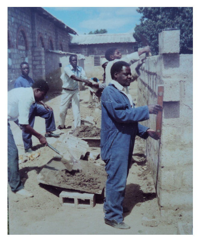
Construction at plot No. 400/89, John Howard

completed and dedicated in April 1975. Since that time, church membership continued to increase and the building had to be extended every year, in order to accommodate the number of people. In 1976, the Church was given a plot to erect its permanent structure in John Howard Compound, on plot 400/89.