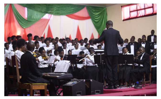
The choir and orchestra in recent times

In April 1996, on the first Monday of the Lusaka camp meeting, there was an evening of music where instrumentalists featured prominently. There were flutists, clarinetists, violinists, violists and a pianist. This sparked off a revival in the camp meeting. Since then, the Choir and Orchestra now feature prominently during the services of most of the urban branch churches.