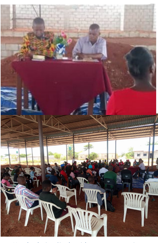
Youths during Single with a purpose seminar

Hosea 7:8, "Ephraim, he hath mixed himself among the people; Ephraim is a cake not turned." Don't get mixed up with the world. Watch out if someone tells you he/she loves you. Is that love perfect? Does it have the characteristics found in 1 Corinthians 13? Desist from illicit relationships, become a genuine Christian and not half baked Christian like a cake not turned. Determine to choose Christ and to follow Him every step of the way.