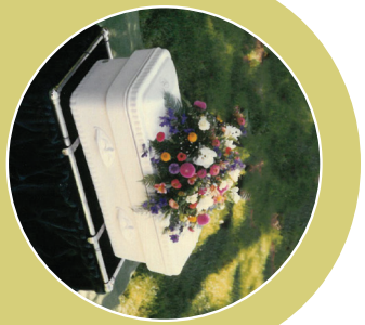
A Life That Counted: Shadrach & 73 Days