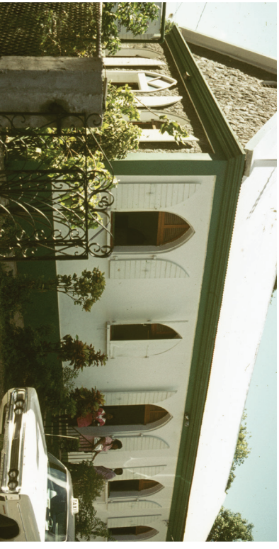
The Charlotte Amalie Apostolic Faith Church in St. Thomas in 1973.

before he was a Christian, and he had been wealthy. He had owned property and some stores, but when the Lord saved him, he gave them up to serve God. He began to preach in the streets and went door to door telling people about the Lord. I also noticed that sometimes his shoes had holes in them. He looked poor to me, and I felt that might happen to my mom too because of the way she was giving away groceries. As a little girl, the things I was seeing did not make sense to me. I kept going to church with my mom but didn't pray for myself because I was mostly there to find fault. Also, I had a reputation in the neighborhood for being bossy, almost to the point of being a bully. My mom was generous with customers, but I was not! I didn't let anyone get away with anything, at the store or at school. Because of my reputation, I knew that if I became a Christian, the kids I